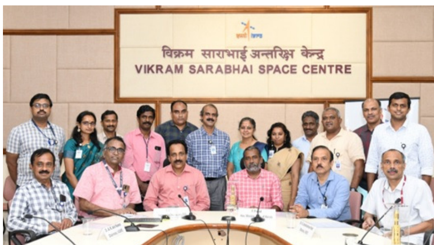
I-CARE team with the dignitaries