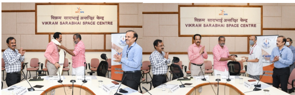
Felicitating Secretary, DOS